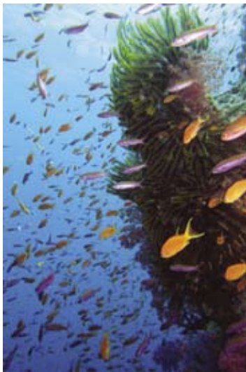
Coral reefs are one type of living shoreline.

Living shorelines represent a new approach to shoreline stabilization. Yet knowledge of their benefits and best practices is scanty and is specific to locations other than San Francisco Bay. This suggests that we develop and test small pilot projects at sites vulnerable to erosion. These projects would test the use of biological treatments in place of hard structures, and test new or modified structures made of materials and in locations that may provide expanded habitat benefits. Many permitting and regulatory issues must be addressed as these pilot projects move forward, including issues of site suitability, material suitability, risk assessment, effectiveness of scale, habitat conversion and mitigation, and potential conflicts in protecting newly created habitat and structures that require ongoing, long-term maintenance.