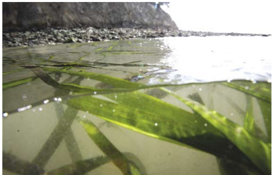
Subtidal eelgrass bed offshore from an intertidal rocky shoreline.