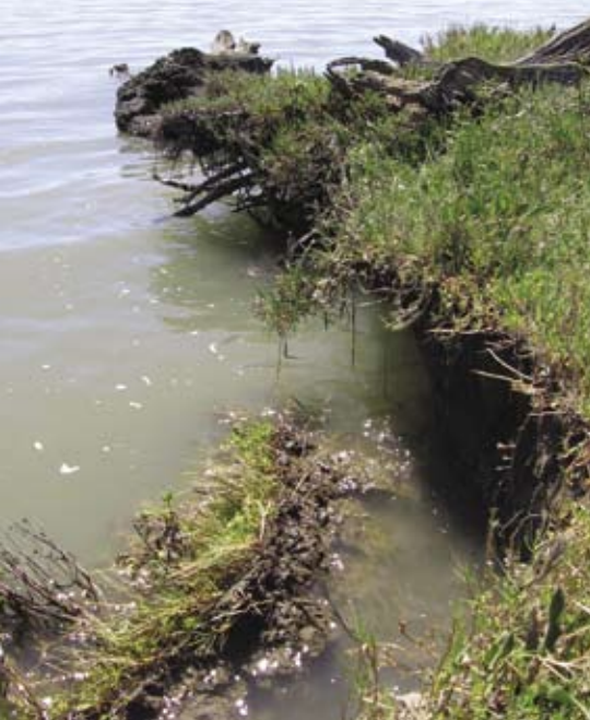
Marshes are eroding around the bay's edges.

Therefore a valuable initial step is to host a workshop on these approaches. Invited participants from other locations in the U.S. and overseas would be asked to present a summary of their findings, and local participants would provide some context on current conditions and challenges. The final step in such a workshop would be to develop a set of recommendations specific to San Francisco Bay.