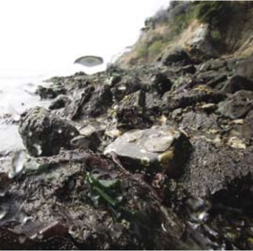
A healthy shoreline edge with oysters and seaweed.

This degraded shoreline edge could be improved using integrated habitat restoration techniques.