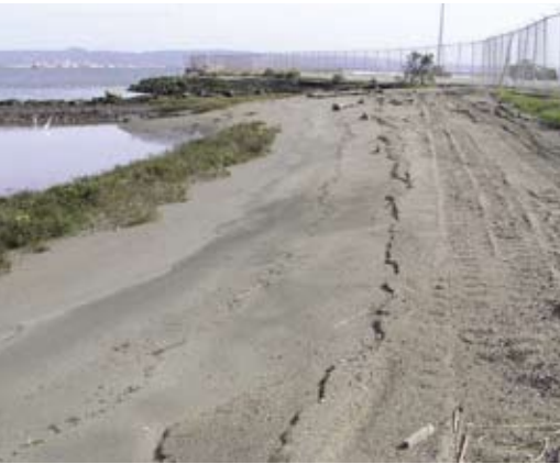
A sand beach restoration project at San Francisco, south end of Pier 94, three months post-nourishment (2006).

Tidal wetlands include subtidal sloughs and channels that connect to offshore subtidal habitats.