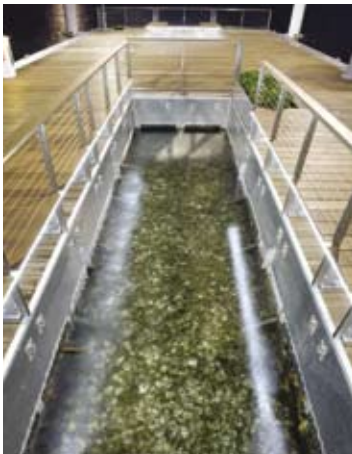
Top:Volunteers plant a living shoreline. Center:The Seattle Seawall tests various substrate types and orientations to identify which provide the best habitat for subtidal species. Bottom:A living dock in Florida uses Virginia oysters to filter the water.