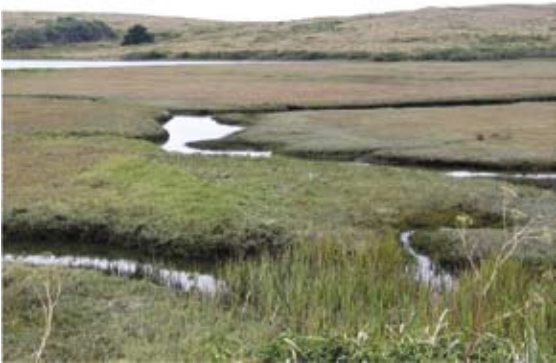
A healthy tidal marsh includes many subtidal channel edges.

Goals in this chapter could be refined by the introduction of expertise from places where these approaches have been tried.